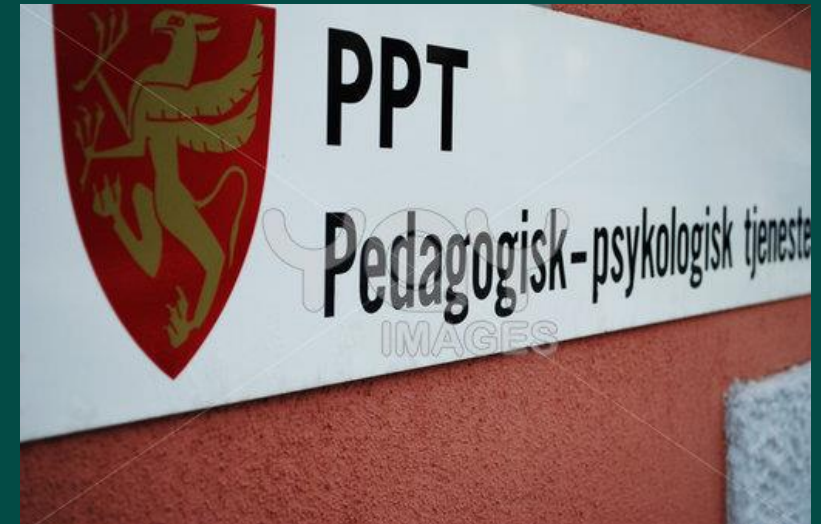
PPT pedagogical and psychological counselling service